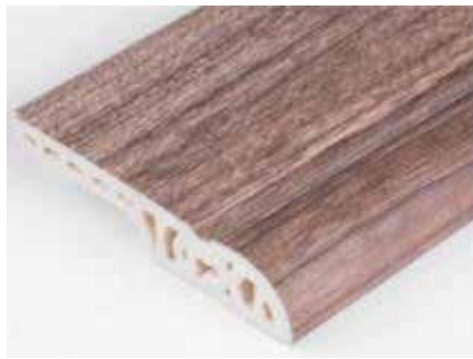
15 x 80 x 2400mm