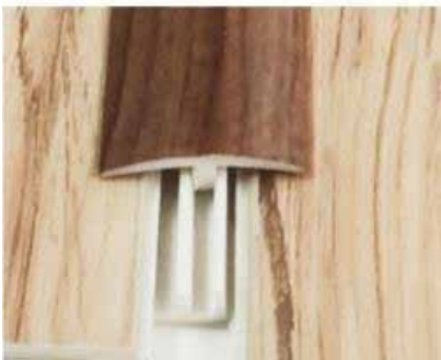
PVC Transition 5.3 x 25 x 2700mm