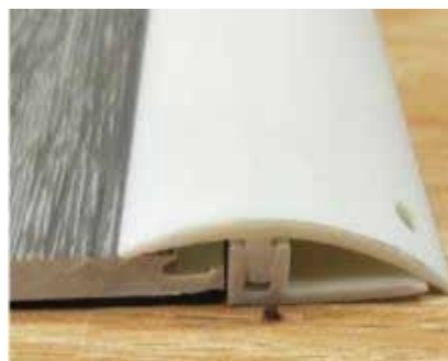
PVC End Profile 5.3 x 32 x 2700mm