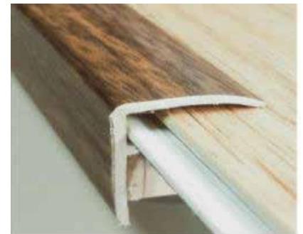
PVC Stair Nosing 4/6.3 x 20 x 2700mm