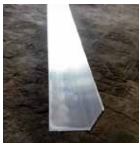
Aluminium L Profile 12 x 22 x 2700mm