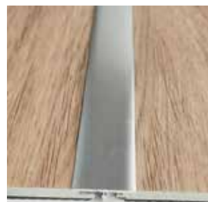
Aluminium T Profile 4.5 x 19.89 x 2700mm