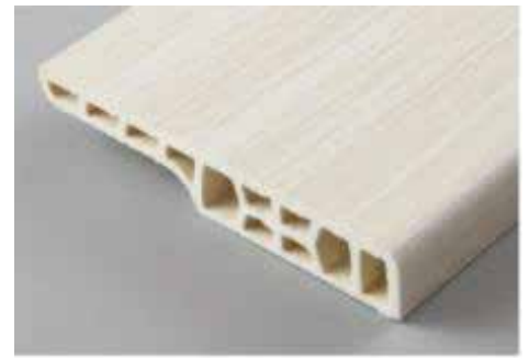
12 x 70 x 2400mm