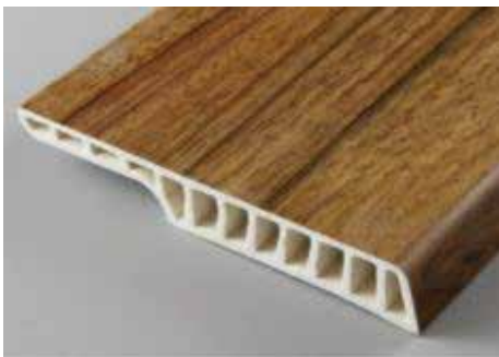
15 x 100 x 2400mm